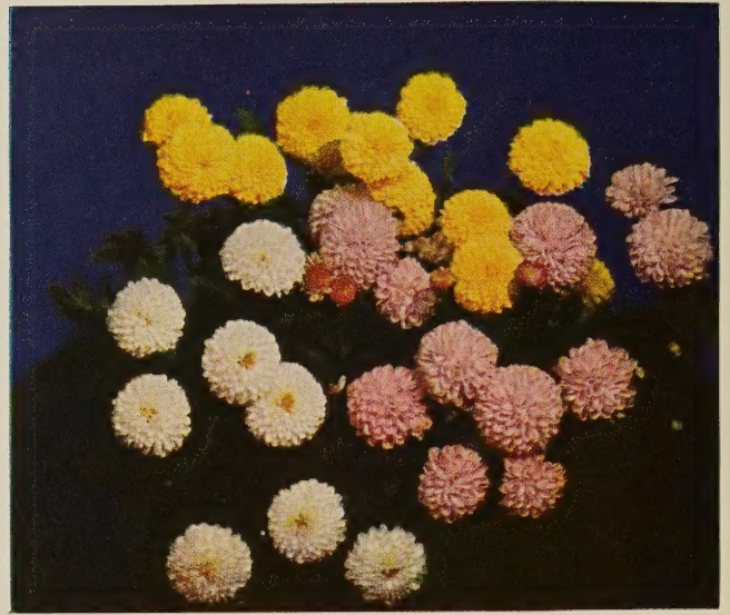
CHIQUITA (Yellow) WHITE BOUNTY (White) ROSITA (Pink) 60c each; 3 for $1.50